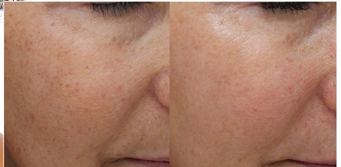
MOXI™ | Post 3 Tx