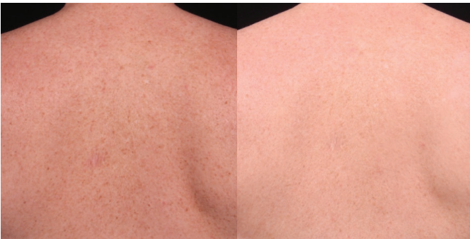
BBL® HERO | 1 Month 3 Tx | Courtesy of Steven Swengel, MD