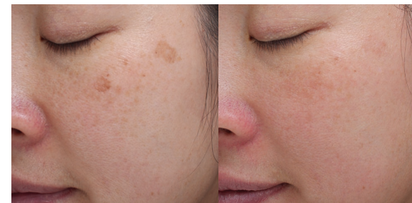
MOXI ™ + BBL ® HERO | 2 Months Post 5 Tx