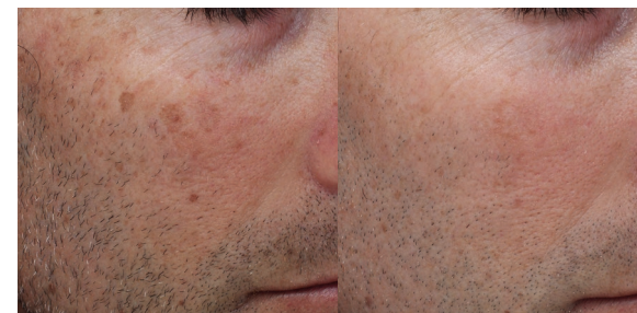
MOXI ™ + BBL ® HERO | Post 5 Tx