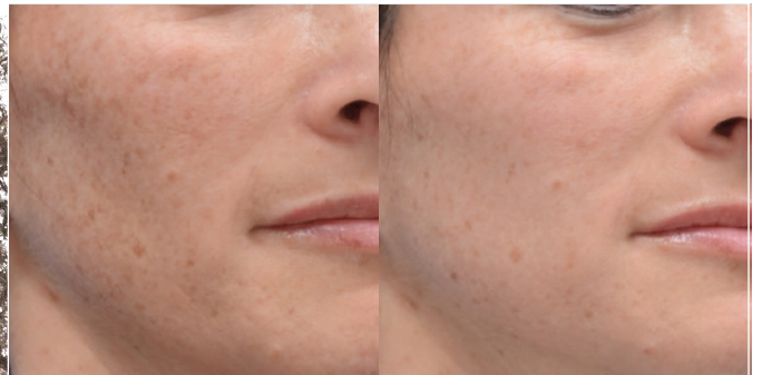
MOXI™ | 1 Month Post 1 Tx