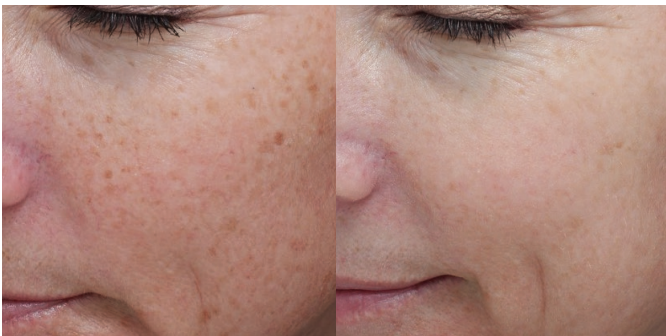
MOXI™ + BBL® HERO | 1 Month Post 1 Tx