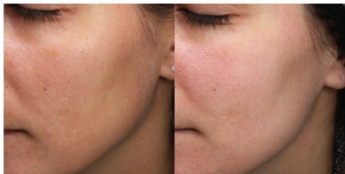
MOXI ™ | Post 3 Tx

Lighten, brighten and refresh with MOXI ™