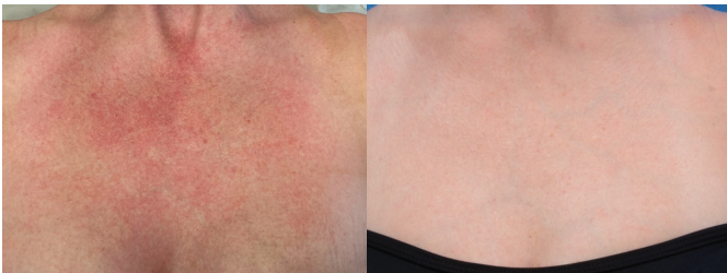
BBL® HERO | 2 Months 1 Tx