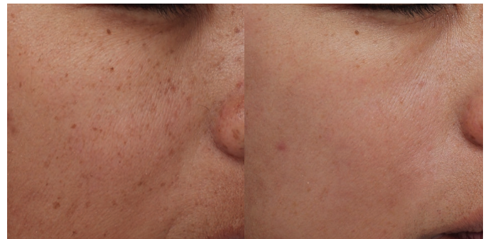
BBL® HERO | 2 Months Post 3 Tx