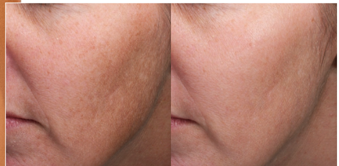
MOXI™ | Post 3 Tx