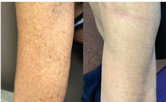
BBL® HERO | 2 Tx | Courtesy of Jason Pozner, MD