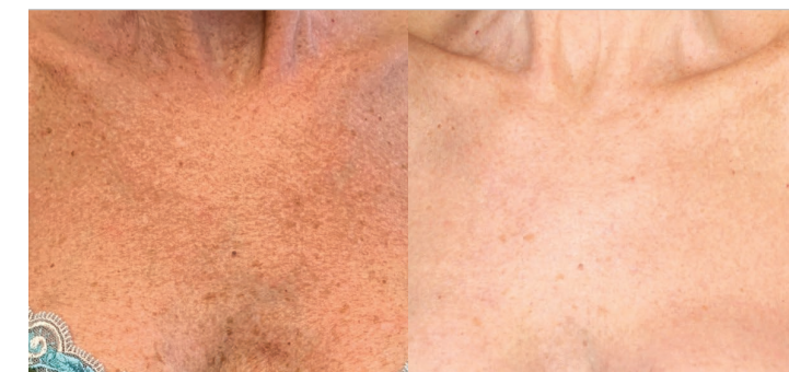
BBL ® HERO | 1 Tx | Courtesy of Jason Pozner, MD